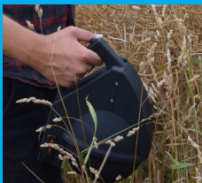
The portability of the VideometerLite makes it the perfect instrument for in-field analysis of seed and grain.