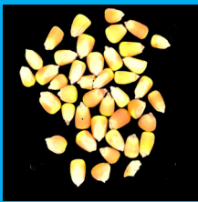
Granular Products with VideometerLite