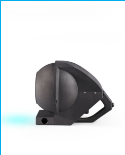
The VideometerLite's different sides.